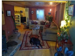
116 Whiterock Ave, Crested Butte $475,000