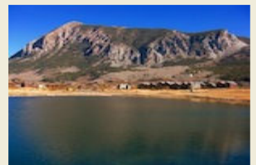
142 Larkspur Loop, Crested Butte $118,000