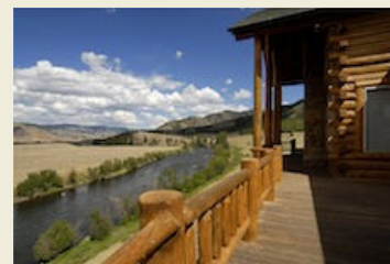
474 Deep Creek Road, Creede $1,595,000

For a complete list of Crested Butte and Gunnison activities please click here .