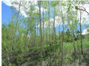
38 Ruby Drive, Mt. Crested Butte $229,000