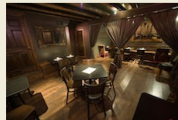
309 Third Street, Crested Butte $985,000