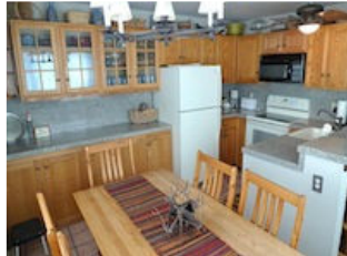
Unit 503 The Buttes, Mt. Crested Butte $299,000

Land sales are on the rise as well with 21 transactions so far this year for a total of $2,984,800 representing a 38% increase over same period last year. Another $1,515,800 worth of land is currently under contract and due to close soon.