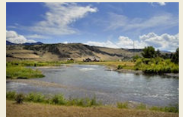
821 Fern Creek Road, Creede $4,195,000

And, thanks to the resort's new partnership with Patagonia, CBMR retail outlets will carry an entire line from this stand-out outdoor apparel manufacturer and staff will be outfitted in new uniforms featuring Gore-Tex throughout the next two years.