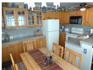
Unit 503 The Buttes, Mt. Crested Butte $299,000

5. Sales tax collections from businesses on Mt. Crested Butte continue upward with this September 6% higher than collections in the same month last year. In the town of Crested Butte sales tax is up more than 7% for the year.