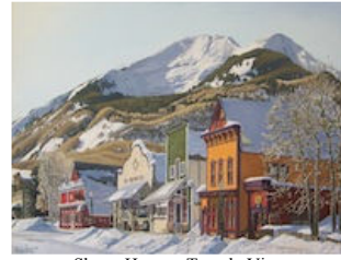
Shaun Horne - Tamale View