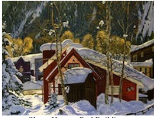
Shaun Horne - Red Buildings