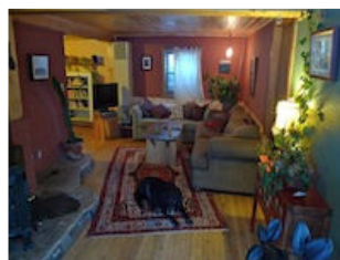
116 Whiterock Ave, Crested Butte $475,000