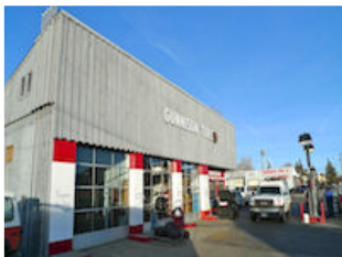
Gunnison Tire Company, Gunnison $745,000

Contact me anytime to discuss the current market and please visit my newly designed website. It's easier to read, has the most comprehensive community information in the valley and the easiest to use MLS property search tool. www.CrestedButteForSale.com - Any feedback would be greatly appreciated!