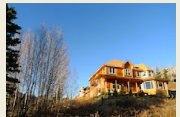
26 Whetstone Road, Mt. Crested Butte $994,000