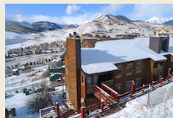
B306 Timberline, Mt. Crested Butte $79,000

After more than 10 years of a partnership with Coors and Colorado Beverage in Montrose, Colorado, Crested Butte Mountain Resort has recently signed with a new beer sponsor. Bud Light is now the official beer of CBMR! There are several reasons for this change. CBMR's marketing partnership is with Anheuser-Busch, of St. Louis, Missouri. A nationally-based partner allows them to activate nationwide marketing initiatives to broaden their reach to bring guests in from outside of Colorado. Anheuser-Busch has already lined up co-branded radio spots across the country. In addition to this, they are planning to make a special Crested Butte ale that will be featured around the resort and eventually in town. While CBMR's partnership with Coors was very much appreciated, "We felt that we needed to leverage this new relationship to bring guests here and to encourage new prospective guests from neighboring states rather than to discount the experience to destination guests who are already in Colorado."