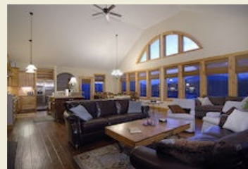
49 Cinnamon Mtn. Road, Mt. Crested Butte $1,099,000