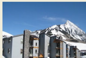
651 Gothic Road, Unit 504E $209,000