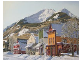
Shaun Horne - Tamale View