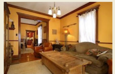
329 Maroon Avenue, Crested Butte $1,295,000