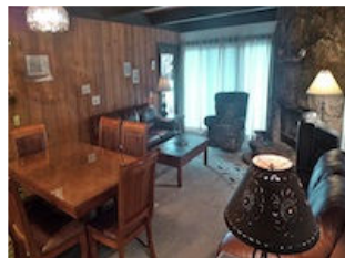
J202 San Moritz, Mt. Crested Butte $275,000