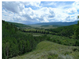
Carbon Creek Parcel $299,000