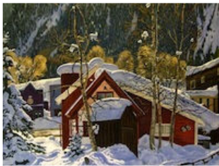
Shaun Horne - Red Buildings

Please Visit My Favorite Gallery in Crested Butte - Oh Be Joyful Gallery