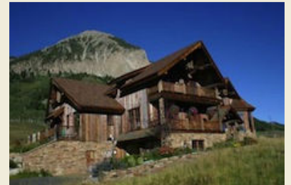
5 Moon Ridge Lane, Crested Butte $3,450,000