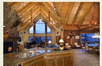
897 Rio Grande Lane, Creede $1,700,000