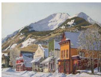
Shaun Home - Tamale View