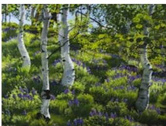
Shaun Home - Aspens and Lupines