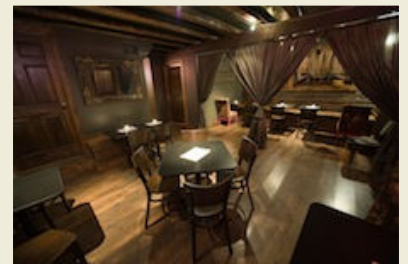
309 Third Street, Crested Butte $899,000