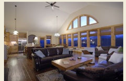
49 Cinnamon Mtn Road, Mt. Crested Butte $1,550,000