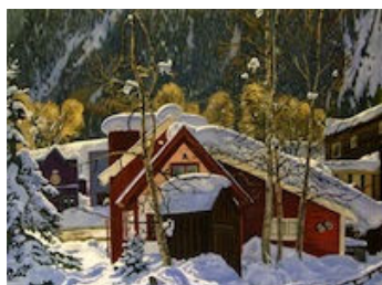
Shaun Home - Red Buildings

Please Visit My Favorite Gallery in Crested Butte - Oh Be Joyful Gallery